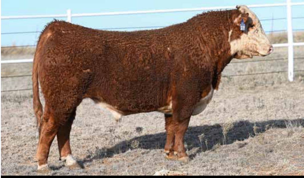
HCC HARRISON3167 L