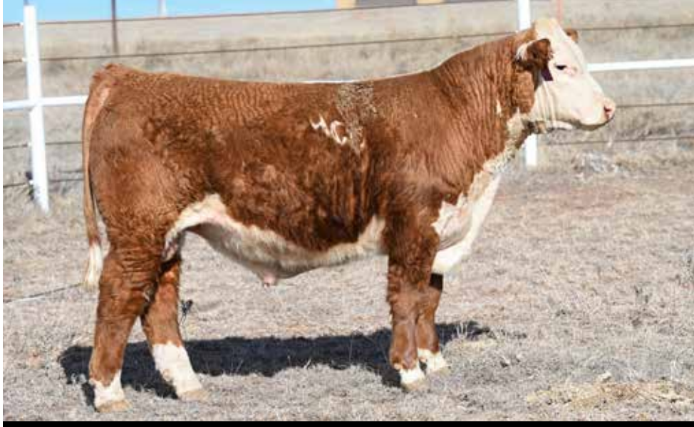
HCC MEMPHIS 4008 M ET