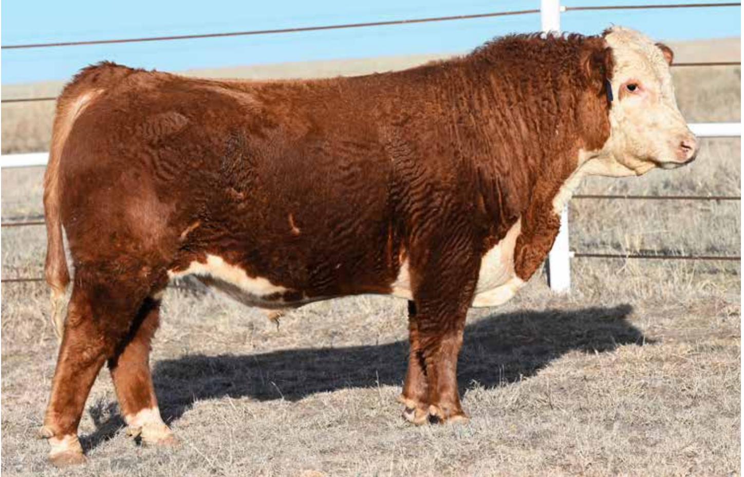
HCC HARRISON 3157 L