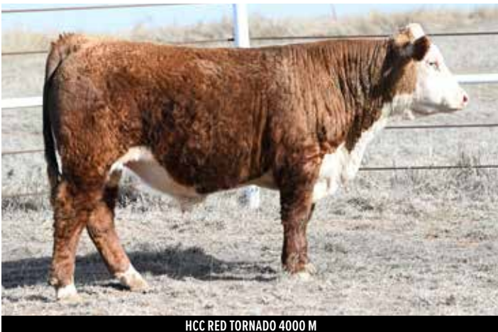
HCC RED TORNADO 4000 M