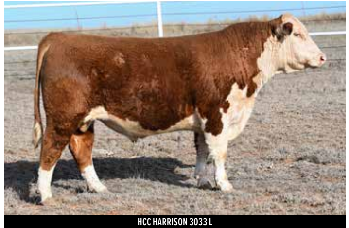
HCC HARRISON 3033 L