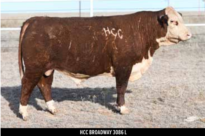
HCC BROADWAY 3086 L