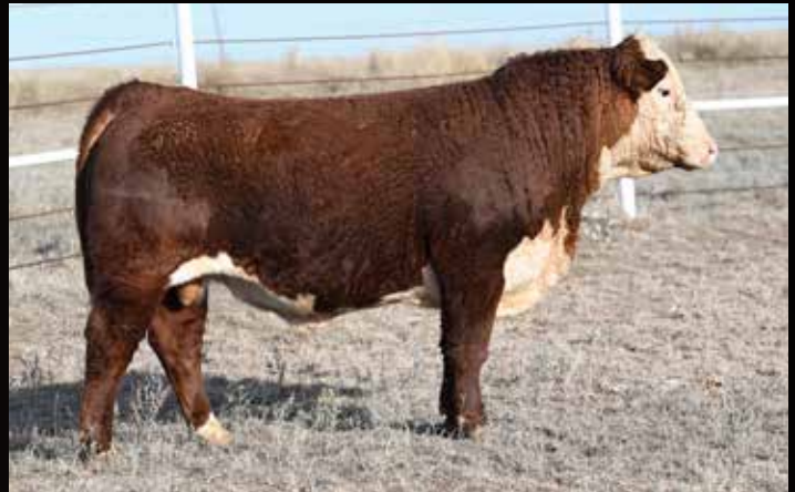
Lot 2 — HCC COWBOY 3060 L