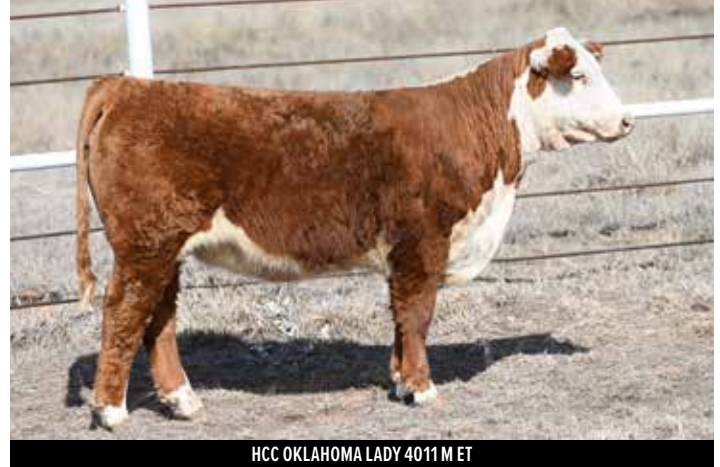
HCC OKLAHOMA LADY 4011 M ET