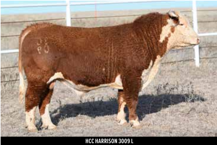
HCC HARRISON 3009 L