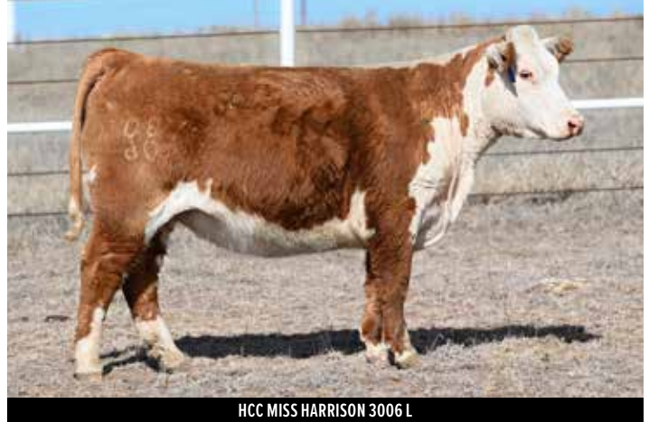
HCC MISS HARRISON 3006 L