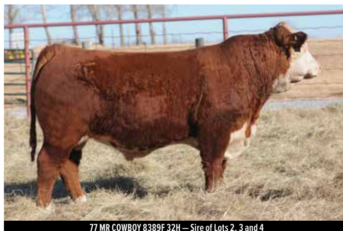
77 MR COWBOY 8389F 32H — Sire of Lots 2, 3 and 4