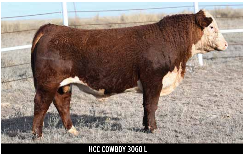
HCC COWBOY 3060 L