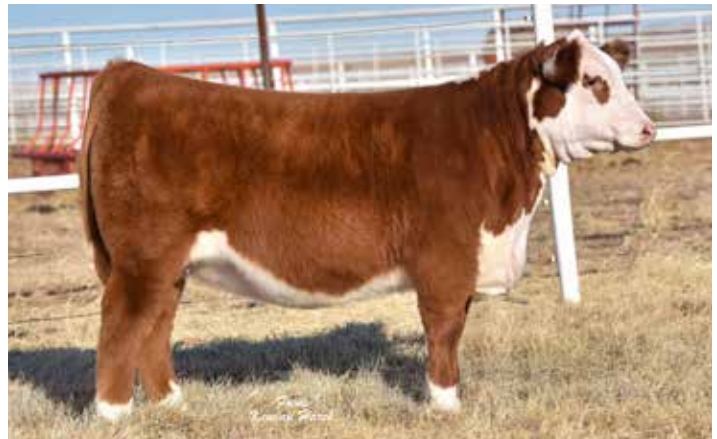
HCC OKLAHOMA LADY 9100 G ET — Full Sib to Lots 35, 36, 37, 46 & 47