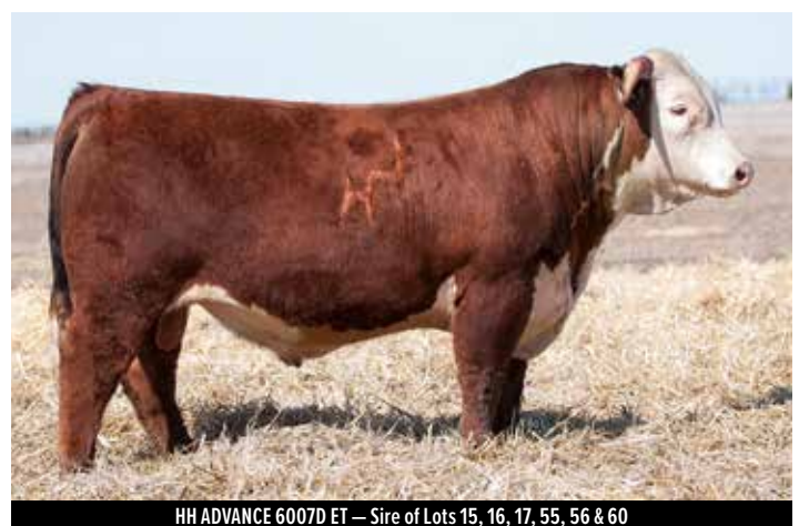
HH ADVANCE 6007D ET — Sire of Lots 15, 16, 17, 55, 56 & 60