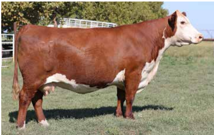
77LOEWEN48MS REVOLUTION344NET — Grandam of Lots 5, 6 and 7