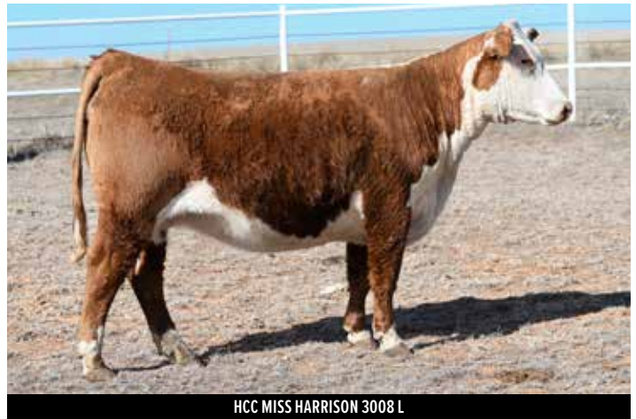
HCC MISS HARRISON 3008 L