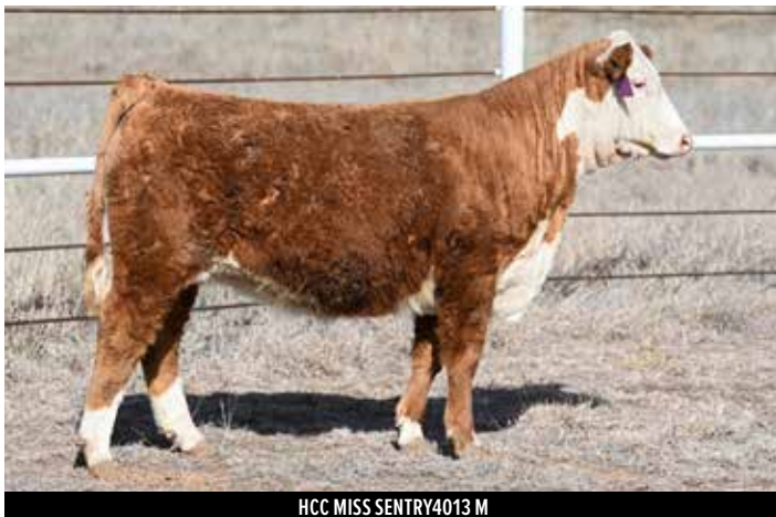
HCC MISS SENTRY4013 M