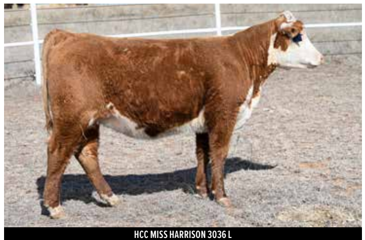
HCC MISS HARRISON 3036 L