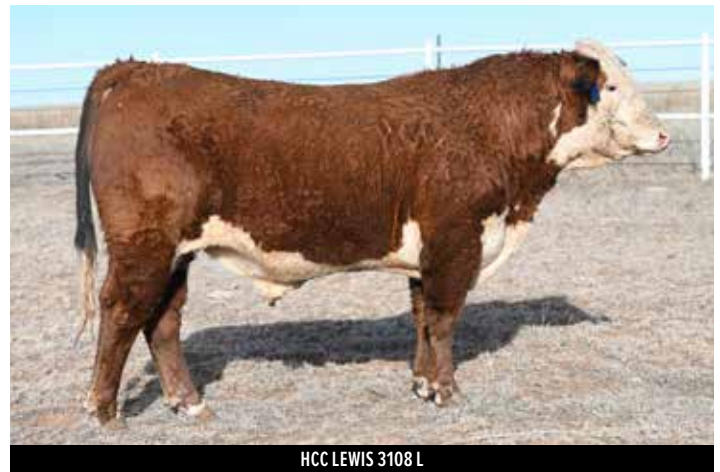
HCC LEWIS 3108 L