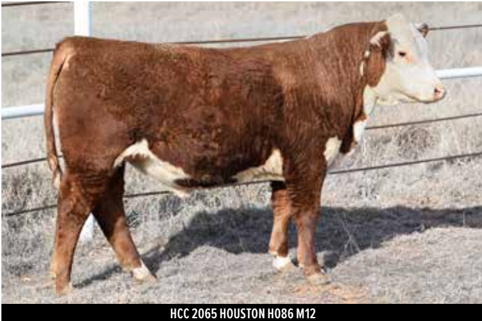
HCC 2065 HOUSTON H086 M12