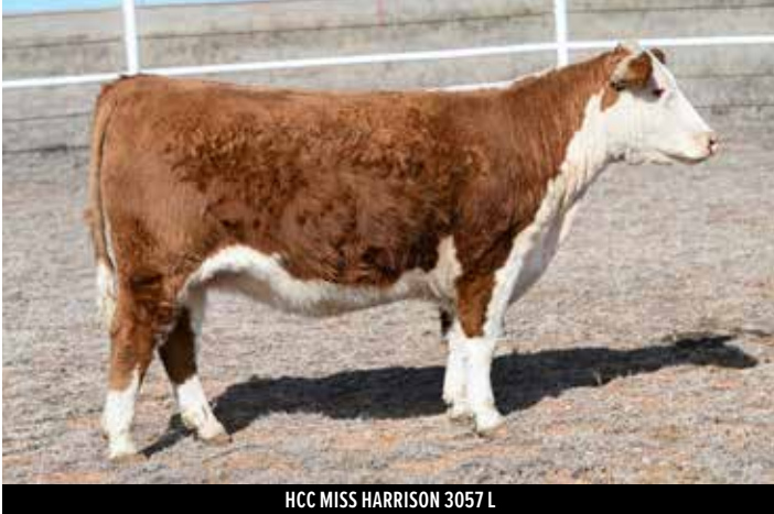
HCC MISS HARRISON 3057 L