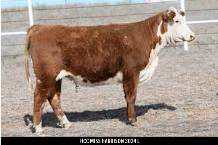
HCC MISS HARRISON 3024 L