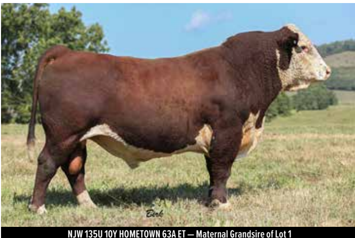
NJW 135U 10Y HOMETOWN 63A ET — Maternal Grandsire of Lot 1