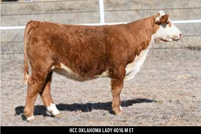
HCC OKLAHOMA LADY 4016 M ET