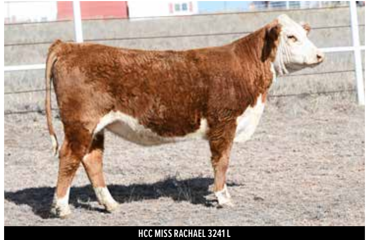
HCC MISS RACHAEL 3241 L