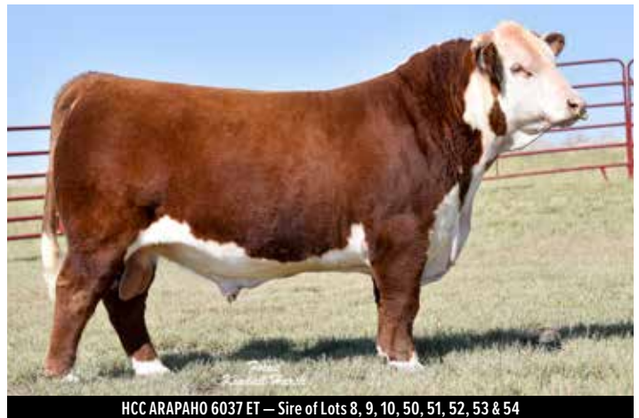
HCC ARAPAHO 6037 ET — Sire of Lots 8, 9, 10, 50, 51, 52, 53 & 54