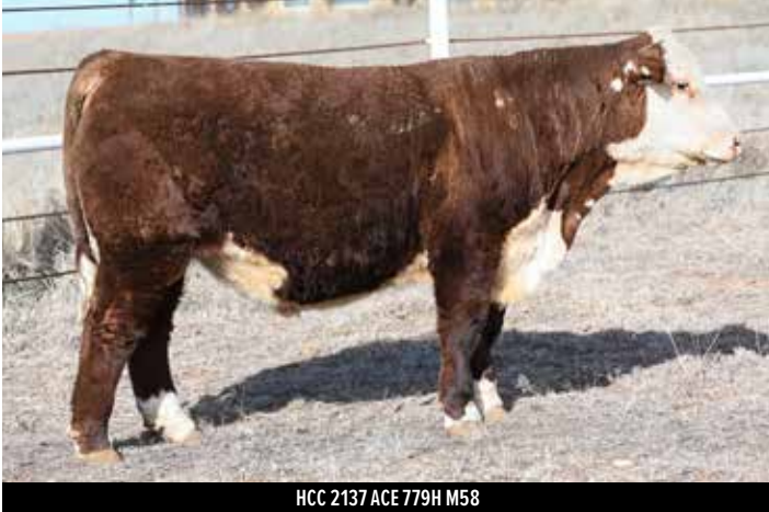
HCC 2137 ACE 779H M58