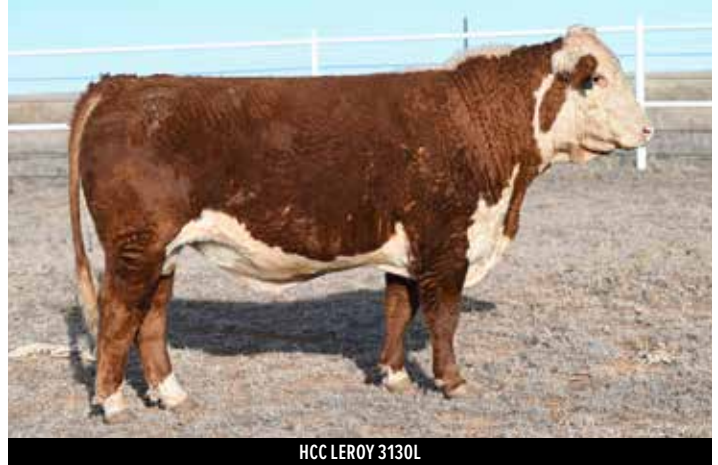
HCC LEROY 3130L