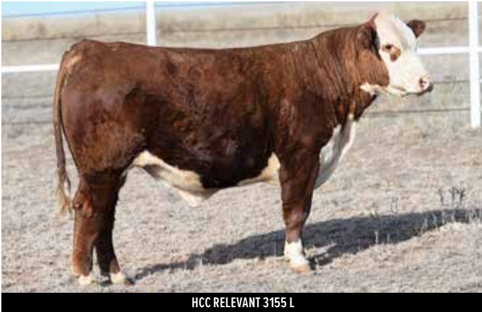
HCC RELEVANT 3155 L