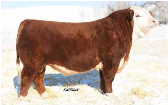
HILLS-GALORE 44Z RESOLUTE 128D — Sire of Lots 35, 36, 37, 46 & 47