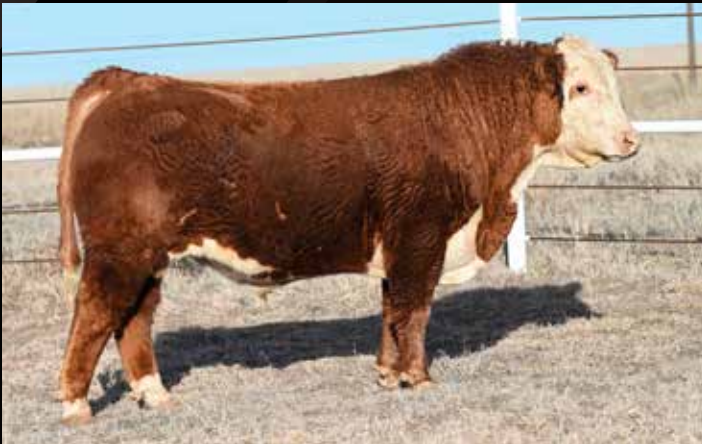
Lot 1 — HCC HARRISON 3157 L