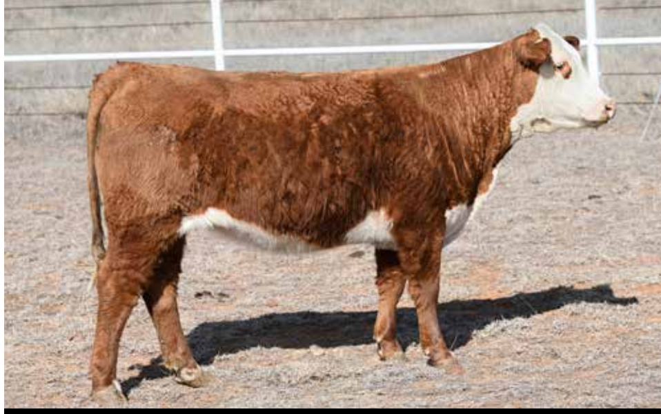
HCC MISS HARRISON 3178 L