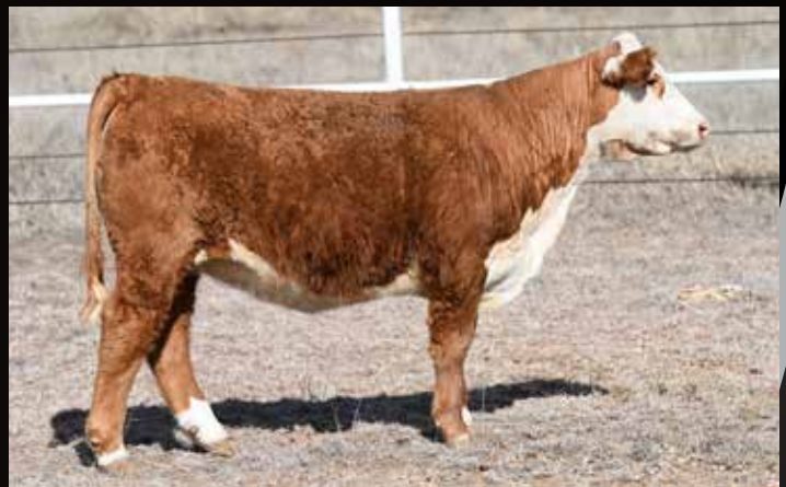
Lot 46 — HCC OKLAHOMA LADY 4016 M ET