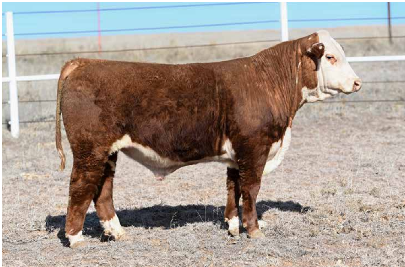
HCC MORGAN 4006 MET