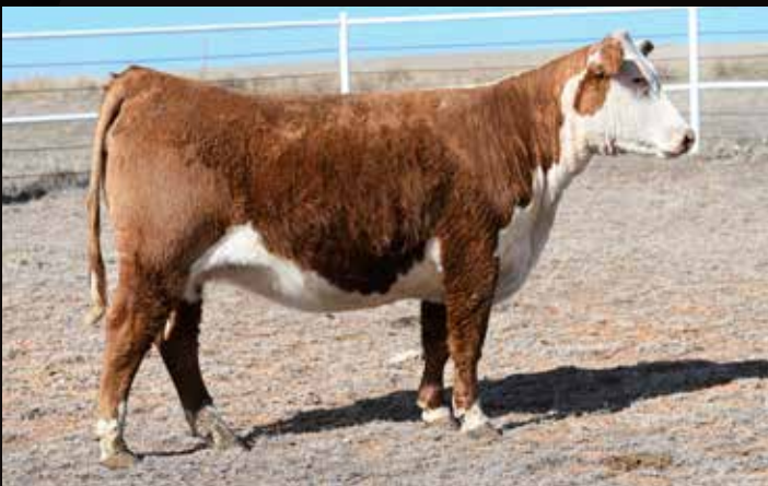
Lot 50 — HCC MISS HARRISON 3008 L