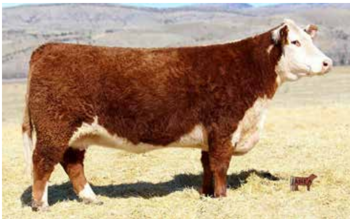
CHURCHILL LADY 002X ET — Dam of Lots 35, 36, 37, 46 & 47

35 HCC MORGAN 4006 MET {DBP} P44624943 — Calved: 2/21/24 — Tattoo: RE 4006 — POLLED