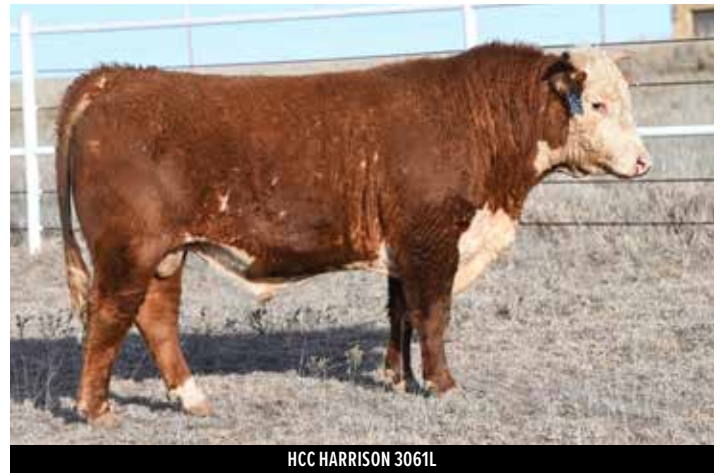
HCC HARRISON 3061L